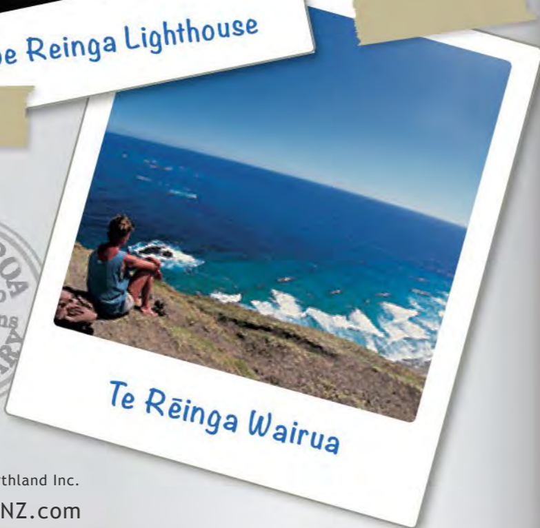
Te Rēinga Wairua